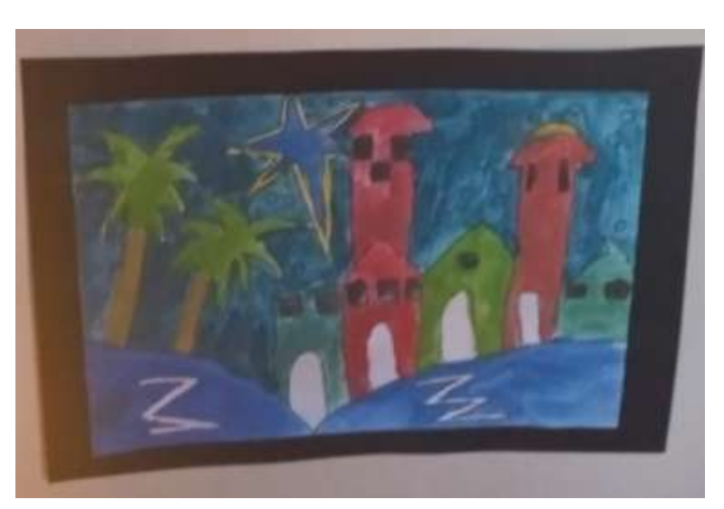
Warmingham School paintings of Little Town of Bethlehem on display in St Leonard's Church.