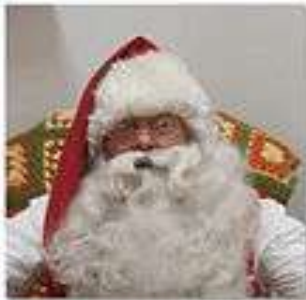
Meet Santa Claus Between 11:30am -1pm

Christmas Fair Raising money for St Paul's Pantry