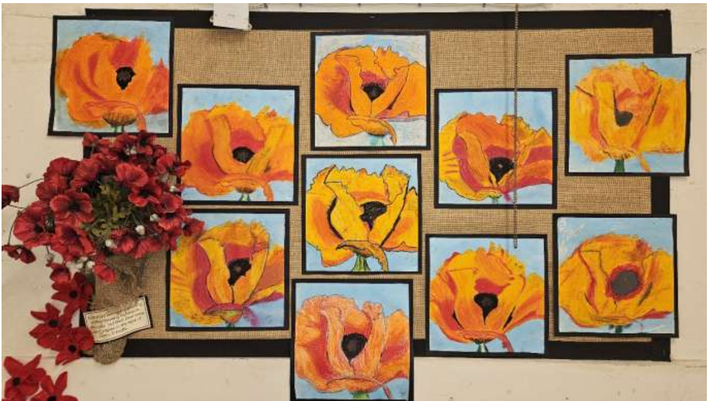
Oil pastel pictures inspired by Georgia O'Keeffe

They have also enjoyed finding out about why the war started. How we started preparing for the war a year before it actually started. The major battles. How the government used propaganda to influence our decisions as well as the life of Anne Frank. The children were then given the opportunity to complete an independent piece of research. Some chose to focus on rationing, the role of women in the war, coding and the weapons used.