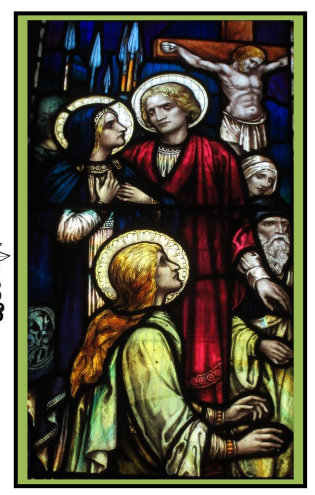
St. Leonard's Warmingham

"The Lord will indeed give what is good, and our land will yield its harvest." Psalm 85:12