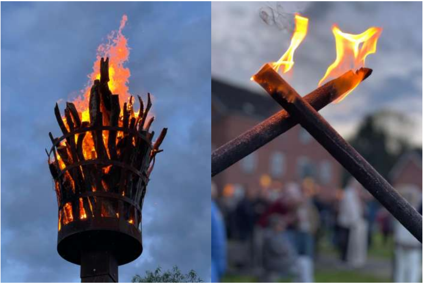
Lighting the beacon on the church field