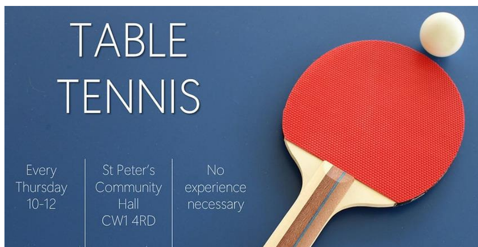
Table Tennis Every Thursday 10am-12noon in St Peter's Community Hall. No experience necessary. Everyone welcome.