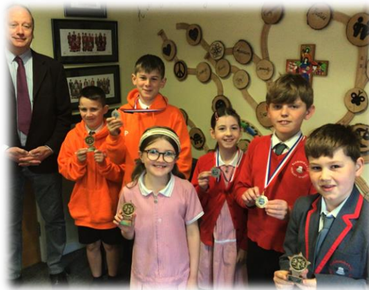
Chess Club competition winners