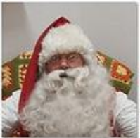
Meet Santa Claus Between 11:30am - 1pm

Name the Elf Raffle Christmas Tombola Arts and Crafts FREE Refreshments