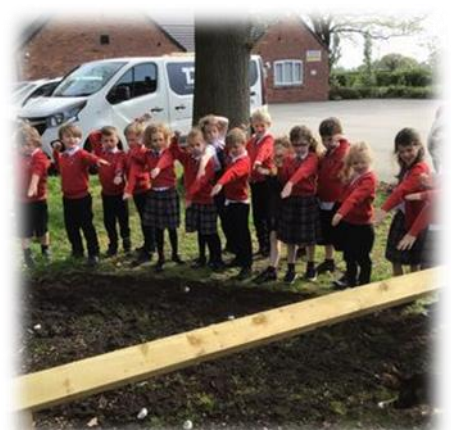
Hedgehogs Class (Year 1/2) made wildflower seed bombs, which they later used to create a wildflower area by the school's front gate.