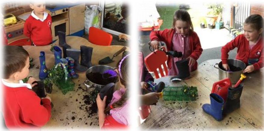
Otters Class (Reception) planted some flowers in old wellies.

The term started with a special project to mark the King's Coronation. King Charles III is passionate about our environment and conservation. At Warmingham CE Primary, we share his passion and to commemorate his Coronation we have been working on some special projects which will encourage more wildlife into our grounds.